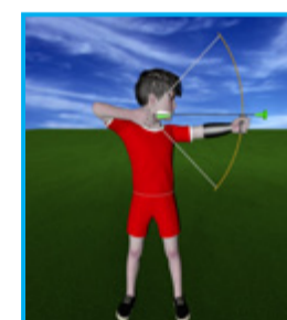
T position – draw bowstring back.